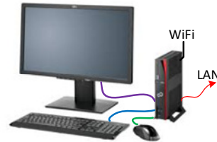
Thin-Client, Keyboard, Mouse and Monitor